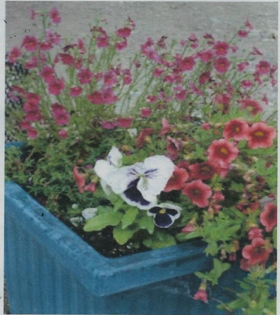
ONE OF 4 PAUVILION PLANTER