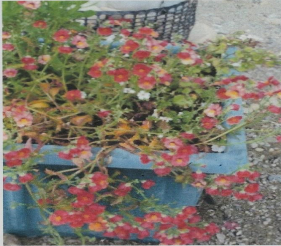
2ND OF 4 PAVILION PLANTERS