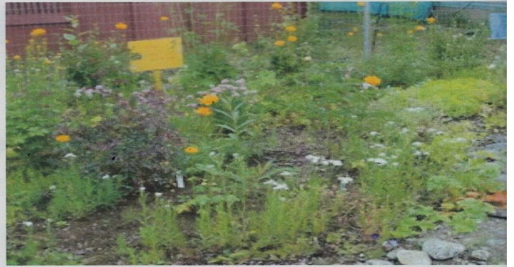
ENTRY GARDEN - NEW SIGN REPLACES YELLOW SIGN